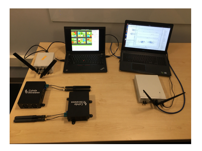
Fig. 4. Testbed configuration for the demo.