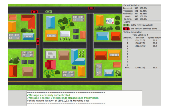
Fig. 5. Vehicles are displayed in red at the locations indicated in their BSMs, while the location of the receiver is displayed in green. Information about the vehicles' speed and heading is shown in the panel on the right of the display.

the attacker. The effect will be visually obvious as the number of neighboring vehicles shown (in red) on the V2Verifier GUI will suddenly drop from four to zero; also, the packet statistics shown on the GUI will indicate the effectiveness of the attack (e.g., by displaying a high packet error rate) as well as its impact on signature verification rate (used for misbehavior detection). This attack will be shown in multiple configurations with variable distance (1-10 m) and variable relative velocity between the attacking USRP and the communicating devices, as well as under both LOS and NLOS conditions.